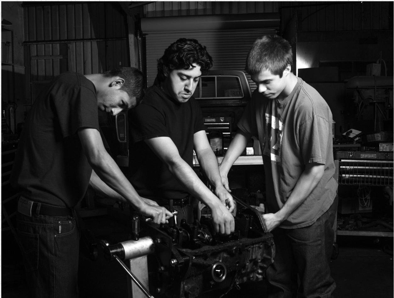
Automotive Technology Class

Since its founding in 1907, Boys Republic has served as a point of contact between the charitable instincts of thousands of open-hearted individuals, families and organizations and the needs of some of society's most troubled youths. The year 2020 was no different. As they have for more than a century, hundreds of generous people became special friends of the troubled young men and women in the program through gifts of their time, their talents, their financial support and of a wide assortment of useful commodities and merchandise. This roster of charitable support is published in tribute to them all.