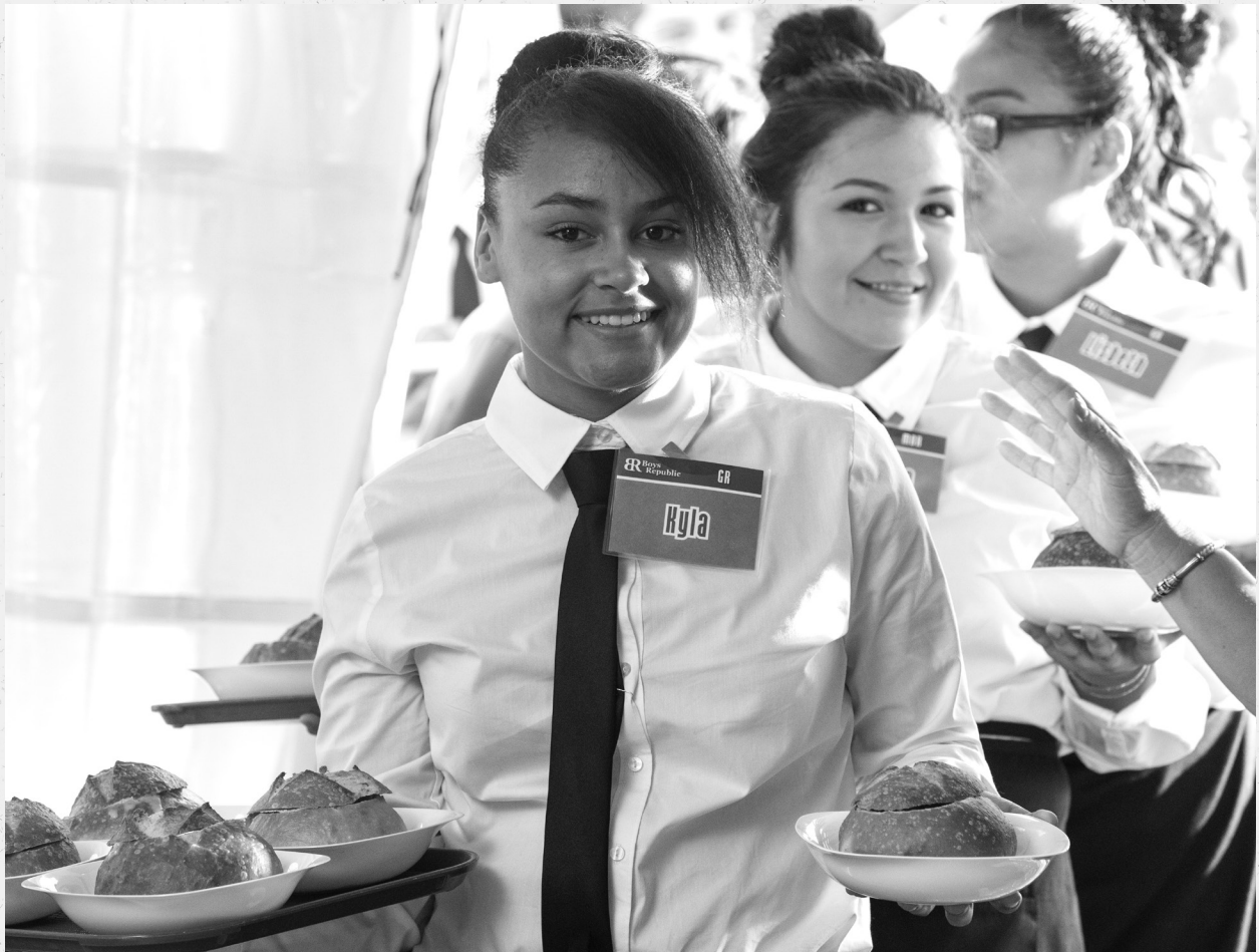
Food Services Students

Since its founding in 1907, Boys Republic has served as a point of contact between the charitable instincts of thousands of open-hearted individuals, families and organizations and the needs of some of society's most troubled youths. The year 2019 was no different. As they have for more than a century, hundreds of generous people became special friends of the troubled young men and women in the program through gifts of their time, their talents, their financial support and of a wide assortment of useful commodities and merchandise. This roster of charitable support is published in tribute to them all.