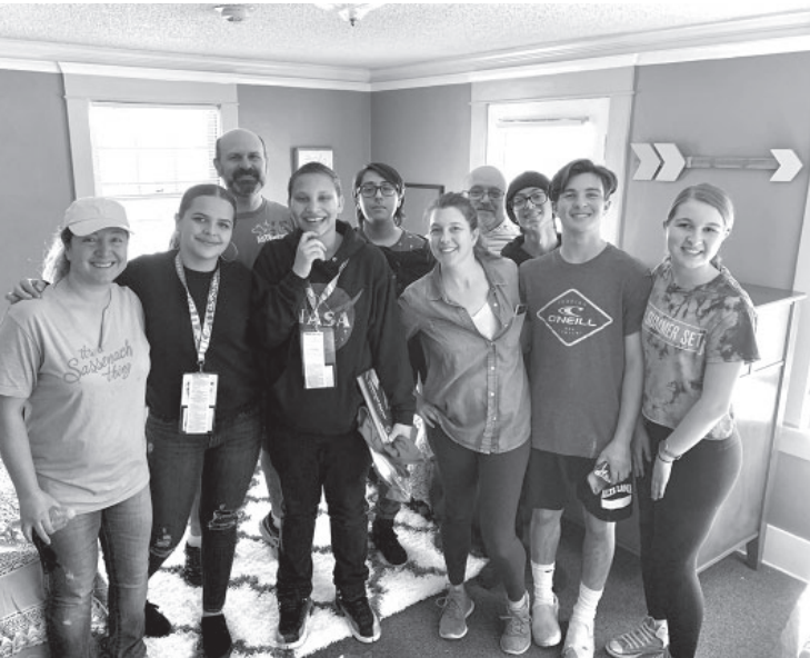
MEANINGFUL GATHERING: Two Girls Republic students pose with volunteers who remodeled their bedroom. The volunteers enlivened each room with a different color scheme.