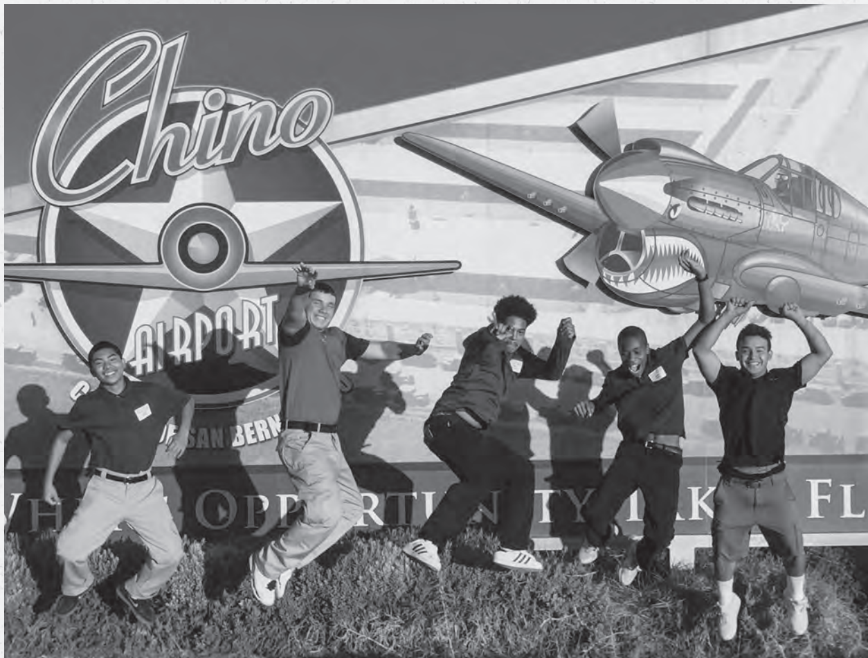
Student Aviation Class

Since its founding in 1907, Boys Republic has served as a point of contact between the charitable instincts of thousands of open-hearted individuals, families and organizations and the needs of some of society's most troubled youths. The year 2017 was no different. As they have for more than a century, hundreds of generous people became special friends of the troubled young men and women in program through gifts of their time, their talents, their financial support and of a wide assortment of useful commodities and merchandise. This roster of charitable support is published in tribute to them all.