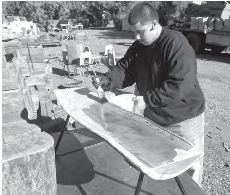
FINISHING TOUCHES: A Landscape student coats his natural bench with a mixture of oils to preserve the wood.

The benches are then sent to the campus metal shop, where students enrolled in the class