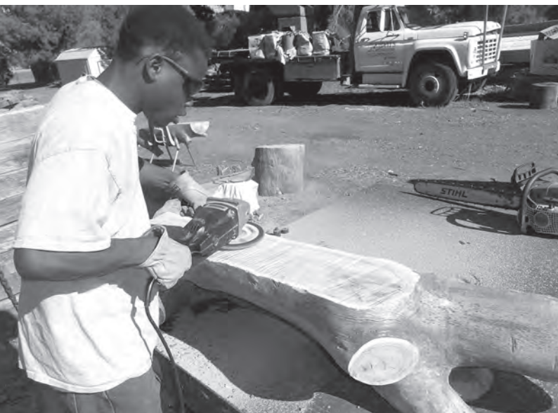
TRANSFORMATION THROUGH WORK: Grinding a smooth surface into the tree fragment, a student begins to create a seat in the tree trunk.

Mr. Scott explains that through the project the "boys discover that they can make more of something that looks damaged, discarded or dead than just burning it. With some effort and vision, what originally looked useless or unwanted is transformed into something of greater value than what it once was."