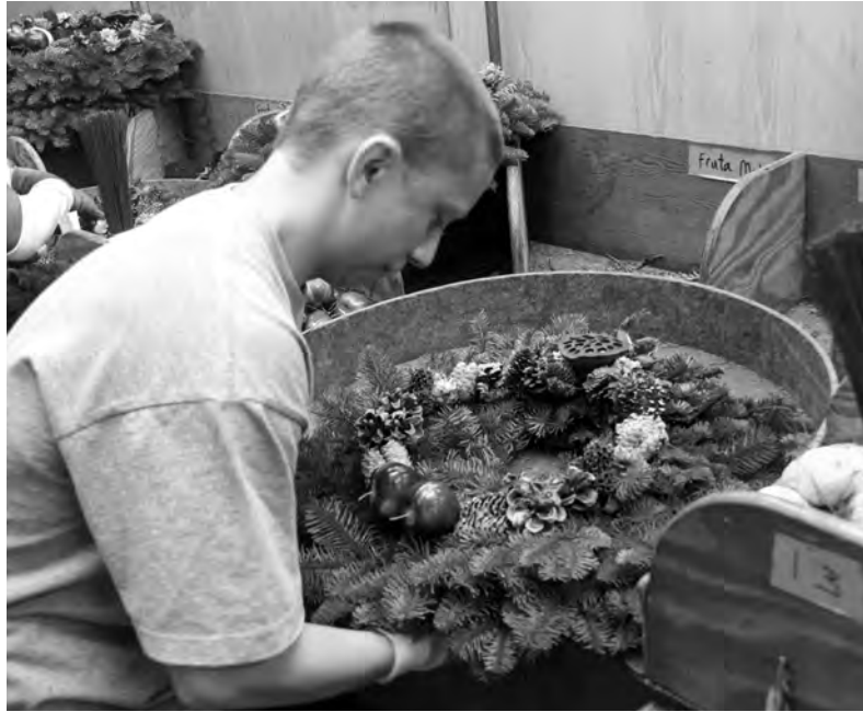
HAND-MADE: Boys Republic students produce fresh Della Robbia wreaths in a 13-day period following Thanksgiving each year — that's about 3,000 wreaths per day. But despite that large volume, the wreaths are made as they always have been made, carefully hand-tied, one at a time.

purpose today, providing meaningful after-school and weekend work for hundreds of students a year and helping Boys Republic raise nearly one-quarter of its own annual operating budget. Proceeds from wreath sales and other self-help activities and donations represent a savings to taxpayers of nearly $4 million a year.