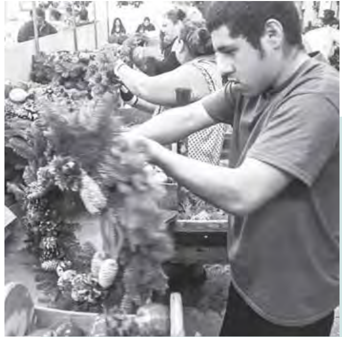
EARNING HIS WAY: A student fastens a ring of pods and cones onto a wreath. Each work shift teaches him how to cooperate with fellow workers, accept corrections and direction from a supervisor and maintain a steady workspace.

Off the field, Mr. Baylor has hosted the 65 Roses Golf Tournament in Southern California since 1978. The annual event raises funds to find a cure for Cystic Fibrosis and has exceeded $5 million to date. Mr. Baylor also established the original 65 Roses Sports Club, a fundraising group that generates significant support for life-saving medical programs. Since its 1979 founding, the 65