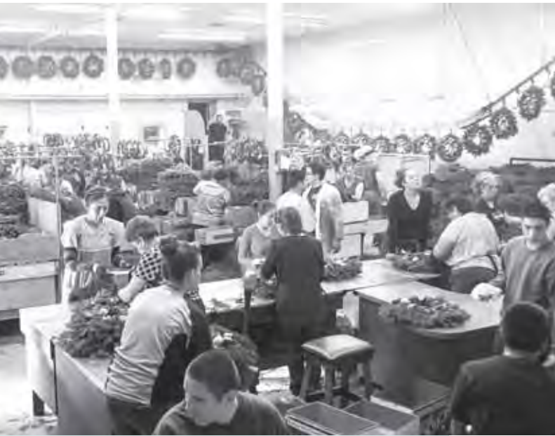
FESTIVE FACTORY: The workshop, known on campus as the pod barn, partitions the room into distinct work stations. Here, students and adults assemble, package, and ship about 3,000 wreaths a day.