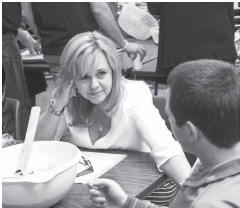
LEANING IN: An Inland Hills Church member and volunteer speaks with a Boys Republic student while baking cookies.