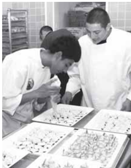
HORS d’OEUVRES: Boys Republic food services students prepared hors d’oeuvres for guests attending the Thomas Crown Affair dinner.