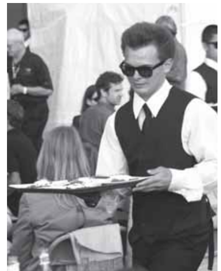
POISE AND POLITENESS: Boys Republic students, in Thomas Crown themed clothing, served 500 guests at the Thomas Crown Affair dinner.