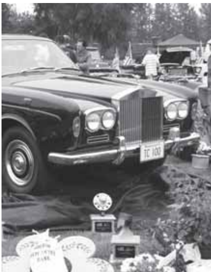
MOVIE ORIGINAL: On display, was the original 1967 Rolls-Royce Silver Shadow two-door sedan that appeared in “The Thomas Crown Affair” movie.