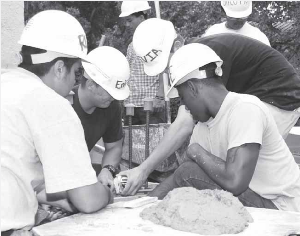
Boys Republic Masonry Class

Since its founding in 1907, Boys Republic has served as a point of contact between the charitable instincts of thousands of open-hearted individuals, families and organizations and the needs of some of society's most troubled youths. The year 2013 was no different. As they have for more than a century, hundreds of special people became special friends of the troubled young men and young women in program through gifts of their time, their talents, their financial support and of a wide assortment of useful commodities and merchandise. This roster of charitable support is published in tribute to them all.