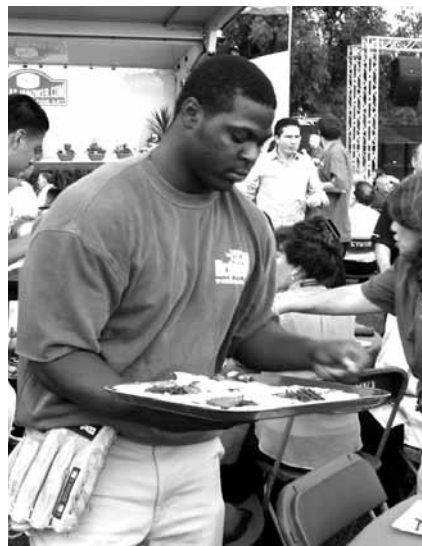
SERVICEMEN: Boys Republic food services students, dressed in “The Great Escape” theme clothing, served 500 dinner guests.