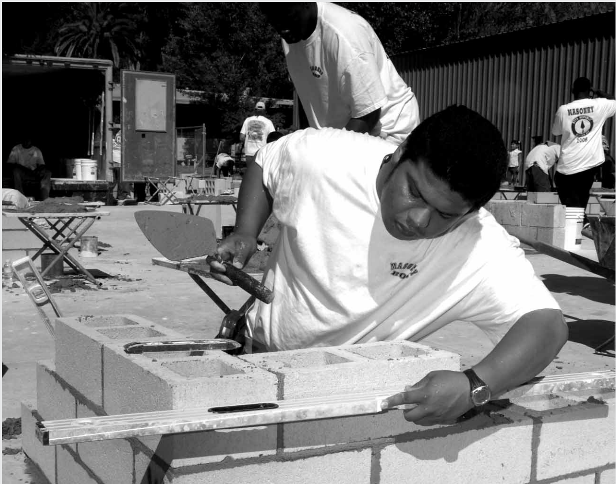
Student Masonry Class Competition

Since its founding in 1907, Boys Republic has served as a point of contact between the charitable instincts of thousands of open-hearted individuals, families and organizations and the needs of some of society's most troubled youths. The year 2012 was no different. As they have for more than a century, hundreds of special people became special friends of the troubled young men and young women in program through gifts of their time, their talents, their financial support and of a wide assortment of useful commodities and merchandise. This roster of charitable support is published in tribute to them all.