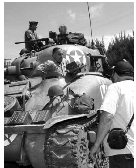
RE-ENACTMENT: The California Historical Group re-enacted the escape scene from the movie, complete with a functioning Sherman tank.