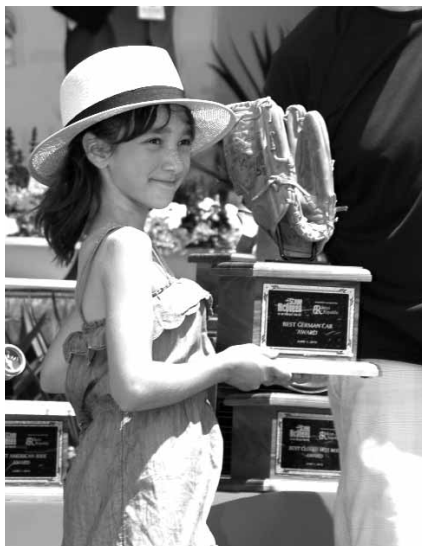
HAND-MADE: 36 imaginative trophies crafted by Boys Republic students were presented to the owners of winning vehicles with the help of a young volunteer.