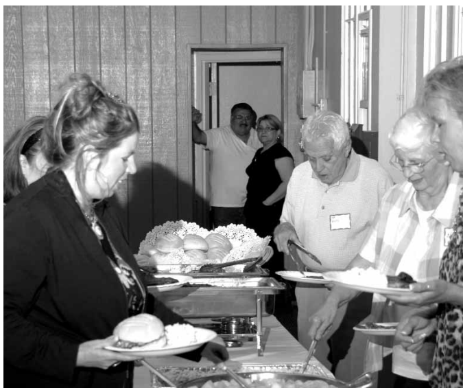
SUMPTUOUS AWARDS DINNER: Guests dined to live music before the presentation of awards.