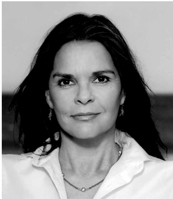
Actress Ali MacGraw

Ms. MacGraw's acting career began when she was offered the leading role of Brenda Patamkin in the screen version of Philip Roth's short novel, "Goodbye Columbus". The movie was success, opening to tremendous popular and critical acclaim.