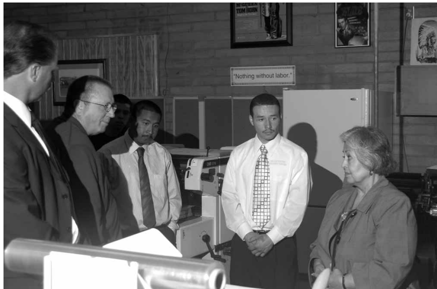
VOCATIONAL PROGRAM TOUR: Senator McLeod (at right) visits the print shop, one of several vocational training sites at Boys Republic's main campus.