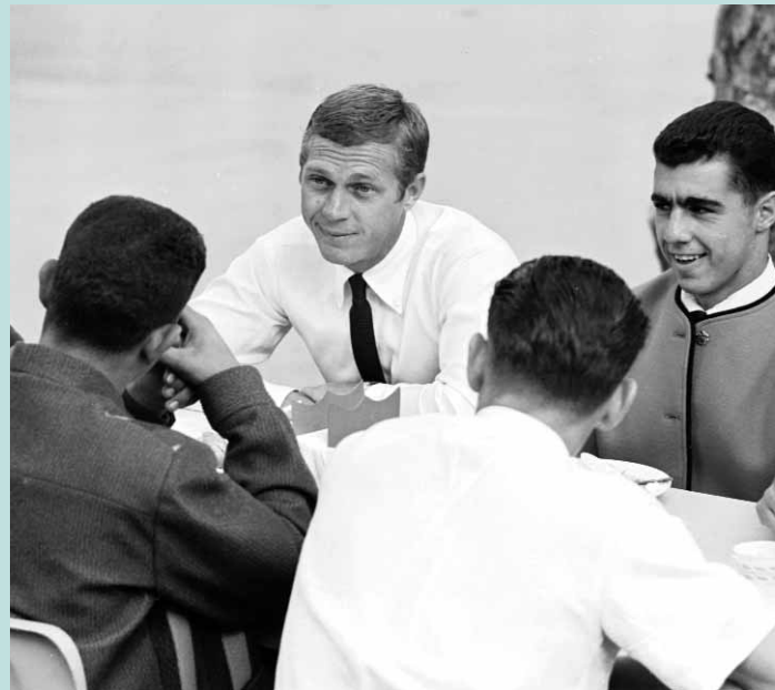
McQUEEN AND FRIENDS: Alumnus Steve McQueen (above) in a 1962 visit with students at Boys Republic. Throughout his life, McQueen remained supportive of his alma mater, as has his family. He would personally respond in writing to students' letters.