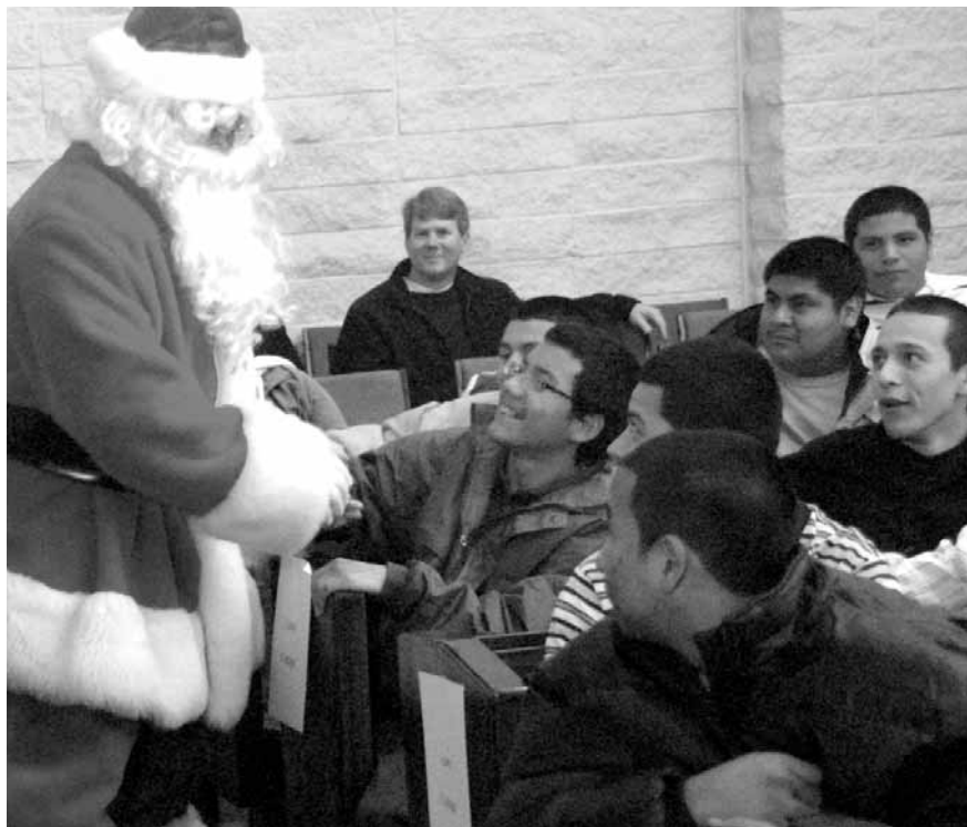
ANNUAL CHRISTMAS PARTY: Students at Boys Republic's main campus enjoy a visit from Santa, last Christmas. The annual party is conducted by the Pasadena Auxiliary, an organization whose tradition of support has endured since 1911.